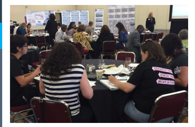
Del Mar students were given the opportunity to participate at the September 22 Design Charette held at the American Bank Center.

More than fifty community representatives reviewed a variety of bridge design elements at a Design Charette hosted by Flatiron/Dragados, LLC (Project Developer) and FIGG Aesthetics Design Team (Project Designer). The charette, held on September 22, was an interactive workshop where attendees voted on preferences regarding a number of aesthetic features such as pedestrian railing design and way finding sculptures. Attendees also reviewed a variety of bridge lighting features. A second charette will be scheduled within the next six months to gather additional feedback to assist designers with finalizing the overall Bridge Aesthetics Plan.