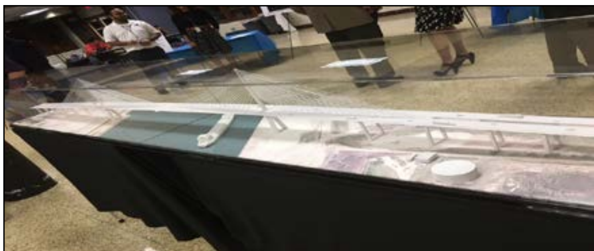
3D model of new US181 Harbor Bridge