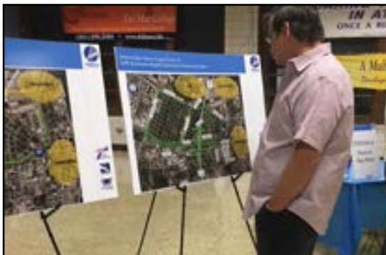
Community member reviews exhibits outlining proposed design changes at the November 17th Public Meeting.

Click on the graphic to view the Public Hearing Notice