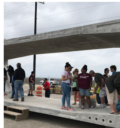
Guests of all ages came out for the March 24th Saturday Sidewalk Talk at the HBP Pre Cast yard in Robstown. Everyone who attended signed their name and even left heartfelt messages for the current Harbor Bridge on the 100 ton segment.