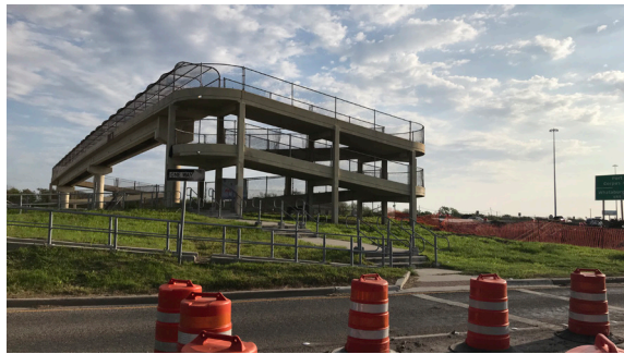
Stillman Pedestrian Bridge prior to demolition is expected to be rebuilt and completed in August 2018.

The Stillman Pedestrian Bridge that crosses IH 37 near Nueces Bay exit is getting an extreme makeover. The long-standing pedestrian bridge was demolished as part of the Harbor Bridge Project in mid-March. The bridge that helped to ensure the safe passage of pedestrians over the busy IH 37 thoroughfare may now be gone, but a newly improved replacement bridge is already under construction. The new Stillman Pedestrian Bridge will include enhanced safety features with the addition of public entrances that will span both the IH 37 main lanes and the frontage road. Construction of the new pedestrian bridge is expected to be complete in August 2018, just in time for the new school year.