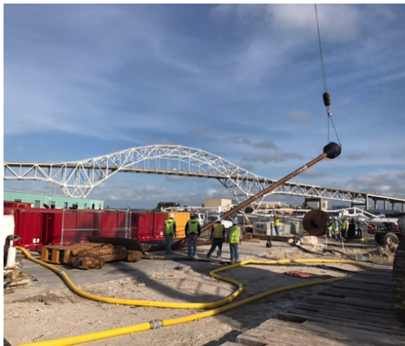
FDLLC crews prepare for the first placement of concrete on the North Pylon.

A major project milestone was achieved on June 2, as crews worked overnight and through the early morning hours to prepare the site for the first placement of concrete on the project. Crews poured concrete for the first test pylon on the north side of the Harbor Bridge. More than 400 cubic yards of concrete were placed into the test pylon shaft that measures 210 feet deep and 8 feet wide. Results from the test pylon will assist with refining the final design specifications and ensuring quality control measures are addressed. Plans to perform the exact same construction activity on the south side of the bridge for the south test pylon are scheduled for late July. Visit our Facebook page for additional pictures and video of the entire process!