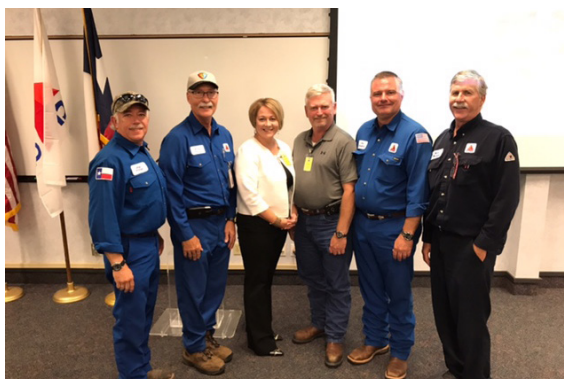
FDLLC team was invited to the Citigo Refinery Lunch & Learn to share information about the Harbor Bridge Project.