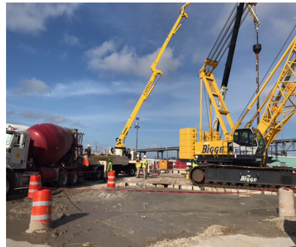
Concrete trucks on site to pour the first placement of concrete on the North Pylon.